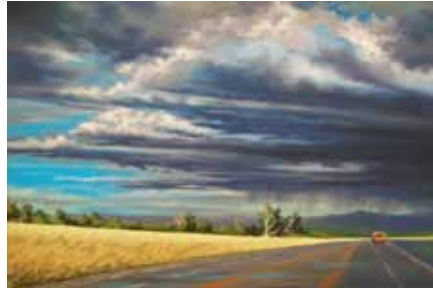
Threading the Needle

I have had 3 paintings accepted into the Cheyenne Depot Railroad Show in Cheyenne, WY. 2 are pastels, "RR Driver" and "Homeward Bound". 4 of my paintings were accepted into The Western Spirit Show in Cheyenne. 3 of these are pastels, "Threading the Needle", "Roadside Vanishings", and "Cross Contours".