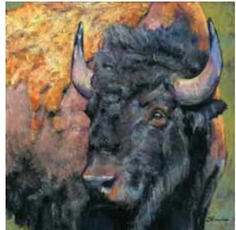
Jackson Hole Bison

I was lucky enough to be one of the two judges at The Art Show at the Dog Show this year and it was an amazing opportunity, a lot of great work. I know that one of the biggest challenges with pastels is the shipping and handling of the artwork. There were some really good pieces that were marred by being improperly fixed and framed. There needs to be a spacer or at least a reverse bevel on the mat to handle the pastels that come off. Investing in a good quality fix is a must. I don't know what to do about using the plexi that some shows require for bigger pieces. I always use glass and a quality shipping container like AirFloat. I know it always makes me nervous when I ship my pastels.