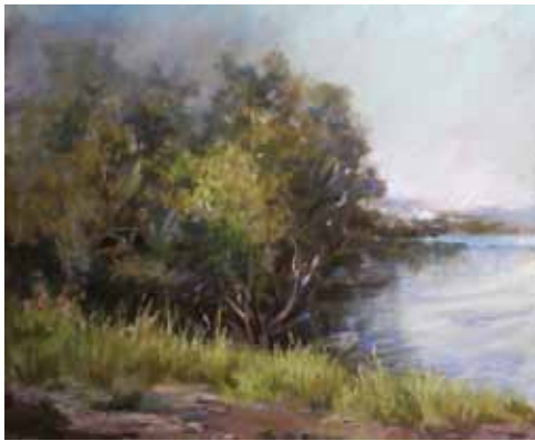
By the Dam